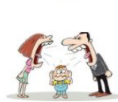
Fights at Home

My Triggers: (Things that make me upset, feel bad, or think about dying.)